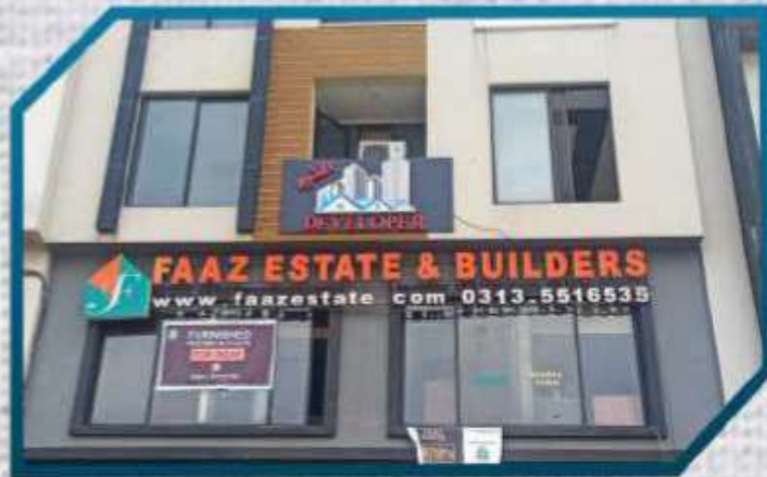
FAAZ ESTATE & BUILDERS