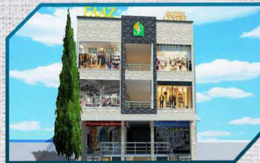
FAAZ SHOPPING CENTRE