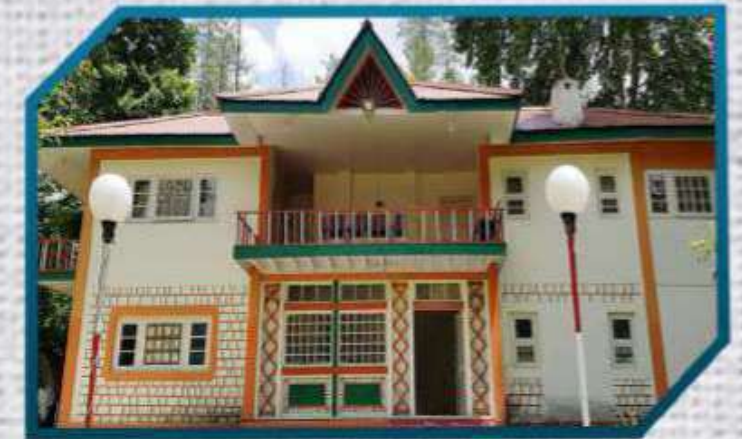
FAAZ PALACE BANJOSA